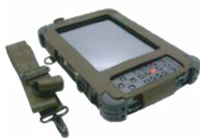
Shoulder Strap Bag (2-point)