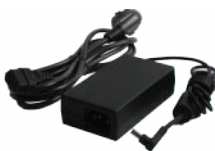
AC Adapter (50W, 100-240VAC)