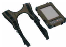
Shoulder Harness Bag (4-point; Handsfree)