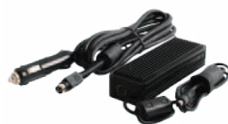
Vehicle Adapter (90W, 11-16VDC and 22-32VDC)